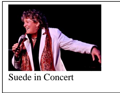
Suede in Concert